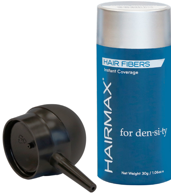
Easy Spray Applicator (Sold Separately)